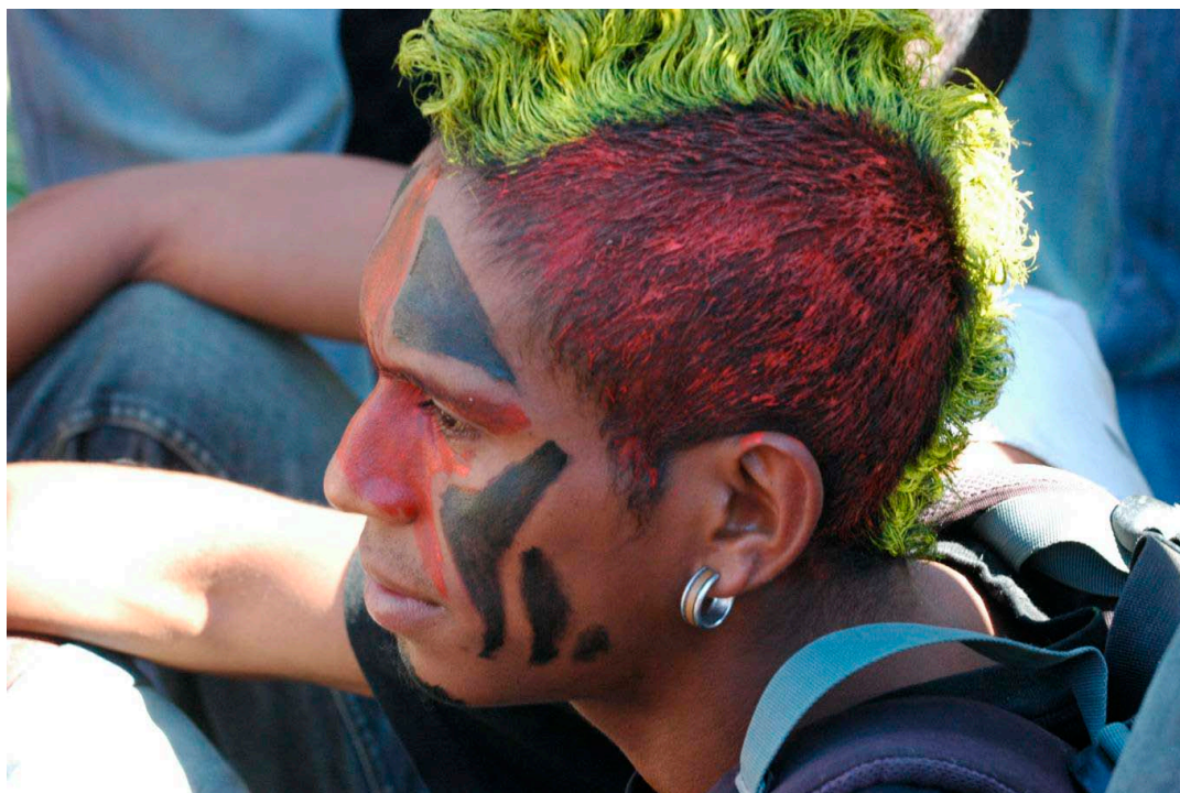
A young protester.

Some Gembel members have had children in the last couple of years. When I asked them what their plans are for their children, considering that found it almost impossible to finish their own schooling – let alone to get a job – they shrugged and laughed. “ Loron ohin ne’e hau moris ”, I live for today, they say. Their marginality in independent Timor-Leste restricts their capacity to plan beyond the present. Meanwhile, the past, as it is constructed in national discourse, does not belong to them. What matters is the present.