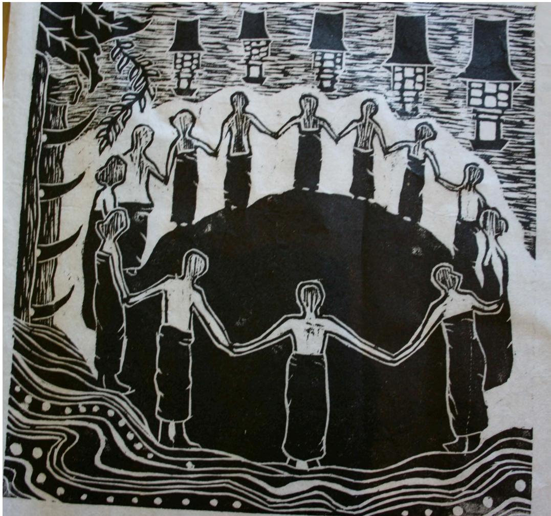
“Tebe-hari” by Bayu, one of the Gembel artists.

The picture Gembel presents is complex in light of Timor-Leste’s postcolonial redefinition. This group is representative of a new generation of youth in Timor-Leste who are coming of age in an era radically different from that of the older members of the Geracão Foun and where the new nation-state insists on defining parameters of inclusion and exclusion. The case study of Gembel illustrates the ways in which power relations become replayed in the post-colony. The older members of the Geracão Foun redefined the borders of belonging by excluding Gembel members from activities because they were perceived to be ignorant and involved in the “wrong type” of demonstration activity. Although their membership to Geracão Foun was constantly being challenged, Gembel continued to draw on past cultural references in their attempts to exercise a degree of agency in their marginalised existence. However, this is a circumscribed agency. Gembel ’s representations of themselves defy being represented as violent and urban-bound youth as portrayed by the conflict paradigm. The ways in which they were able to represent themselves become possible within the context of an international art project, outside of the “traditional” and “local” power structures that marginalises them.