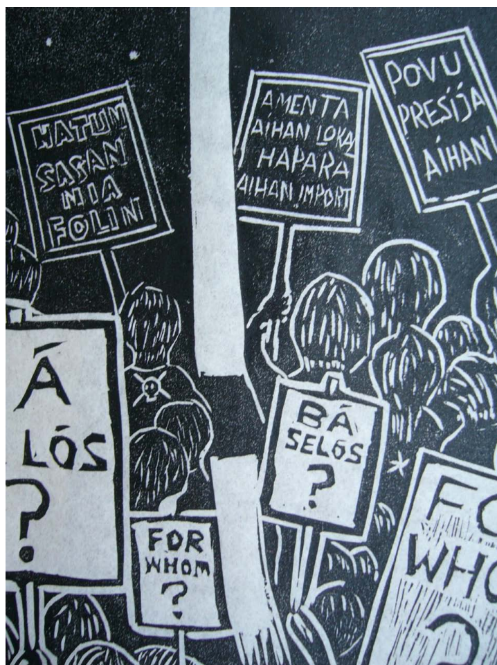
“Povo presija ai han” (The people need food).

month-long schedule of workshops and an exhibition. This international environment enabled creation of a space where East Timorese artists could assert their national belonging and claim to the notion of East Timorese youth.