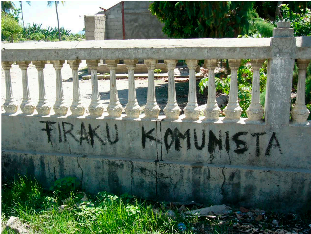
Graffiti painted on a wall in Dili says “Firaku –Komunista” (Easterners are communists) invoking the spectre of the “communist threat” constructed in Indonesia during Suharto’s rule.