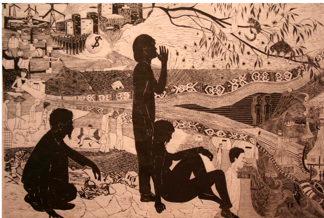
“Recovering Lives Across Borders” The Culture Kitchen 3 X 3m lino cut on paper exhibition in Dili, Timor-Leste as part of the workshop.