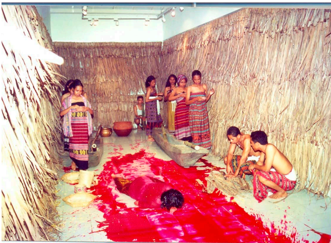
"Geracão Foun" members perform a theatrical protest in Yogyakarta in the 1990s as part of their "Lezaival" theatre group.

During the socio-political crisis, some of the older members of the Geracão Foun ridiculed Gembel for being involved in some of the anti-government protests. The older more influential members of the Geracão Foun asserted that participation in the anti-government protests was the wrong kind of protest and that they were in favour of the Fretilin-led government at the time. Gembel members were subsequently ostracised from social activity at the NGO and the wider NGO community and elite suburb of Farol. A certain paradox was evident in the behaviour of the Geracão Foun towards Gembel members. The older members of Geracão Foun were marginalised by the nation-state for their association with Indonesia, where they had studied during the 1990s and become fluent in its languages and cultures. In turn, the older members of the Geracão Foun marginalised the new generation that emerged out of the 2006 crisis, sometimes referred to as post-independent youth, because of the older members' claim on cultural citizenship based on ideas of youthful patriotism and sacrifice. The younger, post-independent youth were stamped as being a "disgrace to youth".